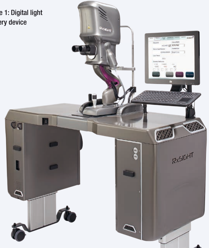
Figure 1: Digital light delivery device

later, a second 1-minute "lock-in" dose is given with the LDD to polymerize all remaining macromer, at which point no further refractive change can occur. Patients wear special UV blocking spectacles until the adjustment and lock in steps are completed.